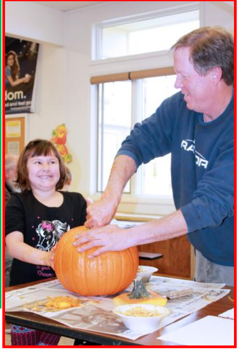
More Pumpkin Carving Memories with the First Grade