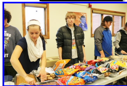
Heritage Tripper's serving it up at the Tailgate Party.