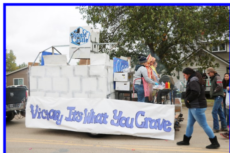
Senior Float-Knight Castle serving actual burgers.