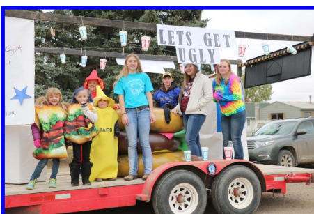
Sophomores-Get Ugly with a Rod's Drive-In inspired float